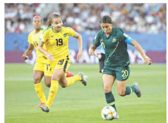
Australia's Sam Kerr, right, scores her side's opening goal during the Women's World Cup Group C soccer match between Jamaica and Australia at Stade des Alpes stadium in Grenoble, France, Tuesday, June 18, 2019.