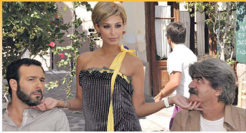
25th GREEK FILM FESTIVAL COMEDY RETROSPECTIVE