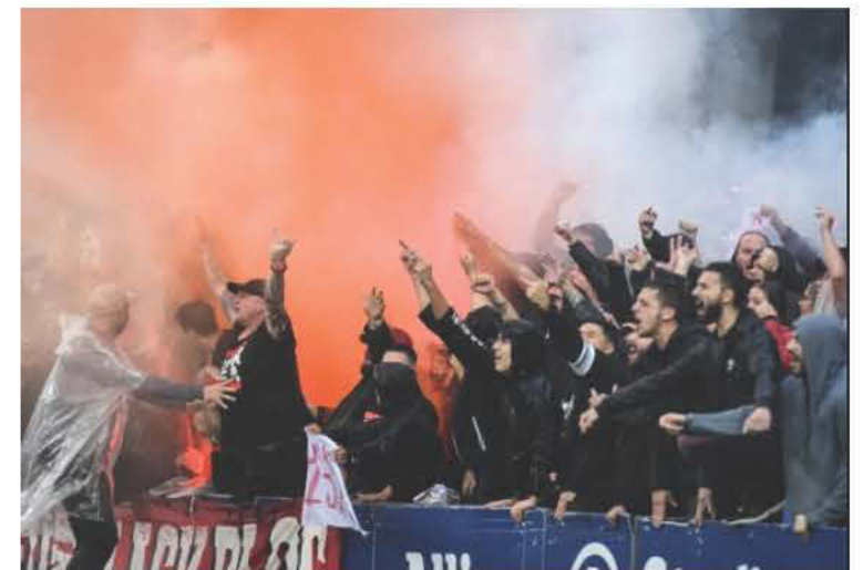
Members of the Wanderers supporting group Red and Black Bloc (RBB) boycotted the final games of the season

Whichever direction they take, the club is aware it faces a pivotal choice with the new stadium at Parramatta due to be completed in little more