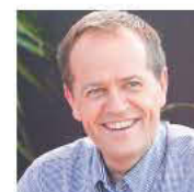
Bill Shorten Leader of the Opposition