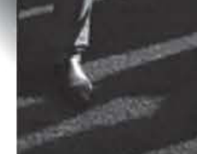
PHOTOS from the officially opening at Cromer Park