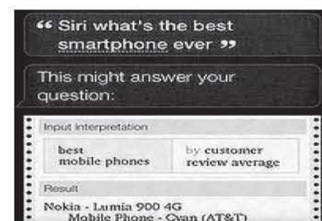
A screenshot of Siri declaring the Nokia Lumia 900 to be the best smartphone ever.