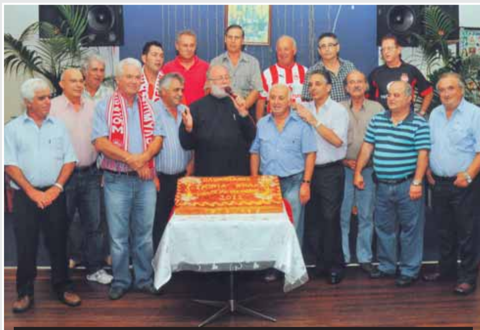
Στιγμιότυπο από την κοπή της πίτας του Συνδέσμου των Φιλιάθλων του Ολυμπιακού στο Σίδνεϊ στο Παναρκάδιαν κλαμπ.