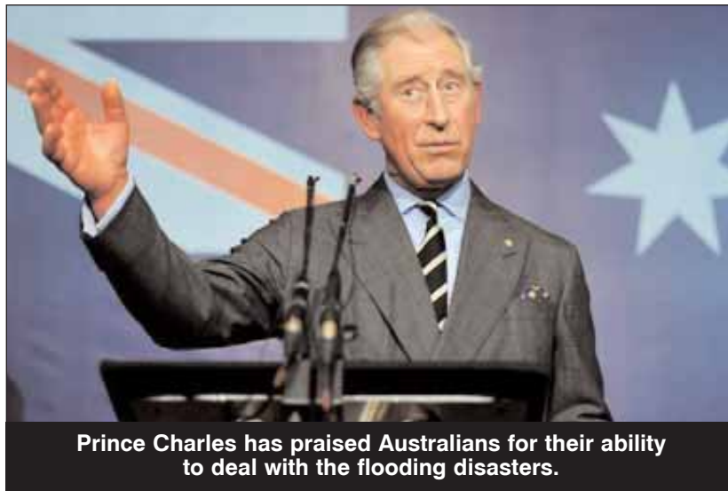
Prince Charles has praised Australians for their ability to deal with the flooding disasters.