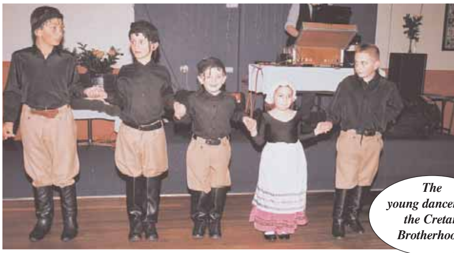
The young dancers of the Cretan Brotherhood.