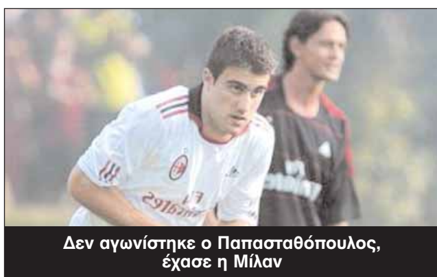
Δεν αγωνίστηκε ο Παπασταθόπουλος, έχασε η Μίλαν

It is believed that Melbourne Victory who last season lost the services of Danny Allsopp to Qatar and later Archie Thompson to serious injury are desperate to sign the former Adelaide United star.