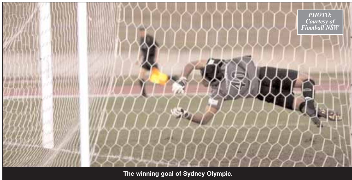
The winning goal of Sydney Olympic.

Has BIG brother Sydney Olympic sealed the West Sydney Berries' fate after beating them 2-1 last weekend in front of an abysmal and embarrassing crowd of "approximately 100"