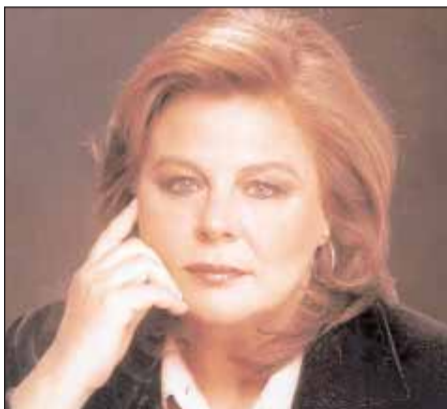
Shipping Minister Louka Katseli