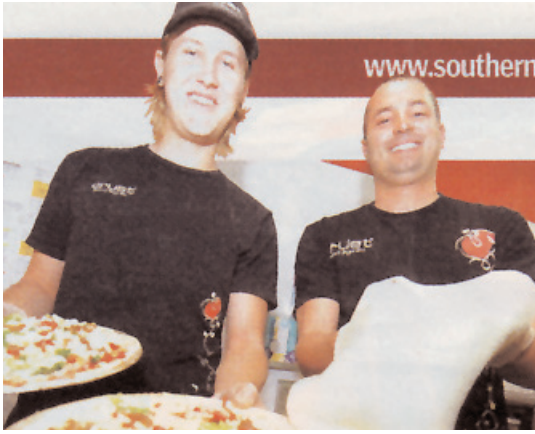
Staff at Crust Pizza Bar in Maroubra are supporting Gold Week.