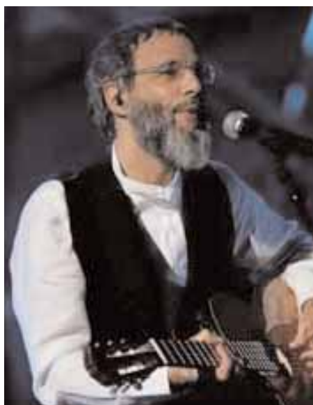
A Victorian MP wants to ban entry to Yusuf Islam (Cat Stevens)

Many Muslims believed the book was blasphemy and it was reported by the New York Times in 1989 that Mr Islam supported the death sentence.