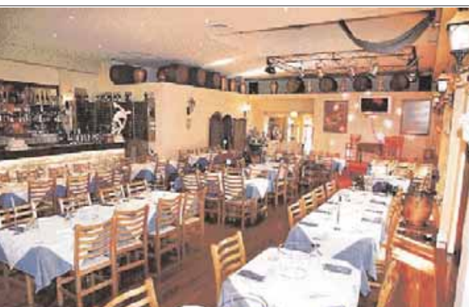
Surrounded by glory: Traditional Greek cuisine awaits at Pericles Greek Tavern.

Pericles' prime rib eye steak is marinated in retsina to give the meat a distinctive flavour. When dining with a partner, Pericles offers some special dishes just for two, including dips for two, mezes for two and a meat platter for two.