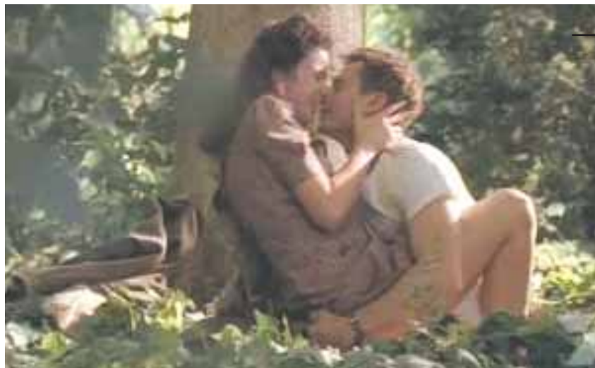
Steamy ... The Pacific takes on Underbelly in raunchy sex scenes featuring actress Claire van der Boom and actor James Badge Dale.

Corner Hawkesbury Road and Hainsworth Street Locked Bag 4001 Westmead NSW 2145 Sydney Australia DX 8213 Parramatta Tel +61 2 9845 0000 Fax +61 2 9845 3489 www.chw.edu.au ABN 53 188 579 080