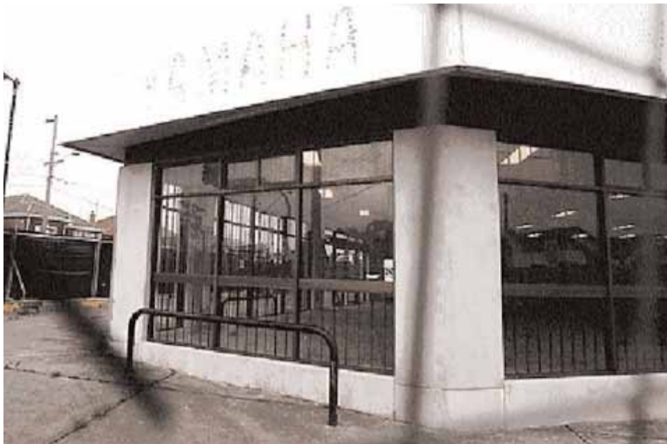
Opening: A firearms shop will operate on this Bexley site.

arms dealer in NSW and includes the NSW Police and Australian Defence Force among clients.