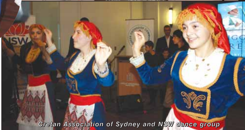
Cretan Association of Sydney and NSW dance group