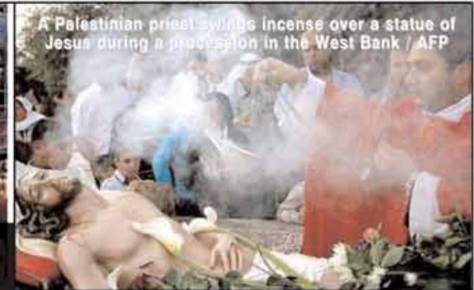
A Palestinian priest swings incense over a statue of Jesus during a procession in the West Bank