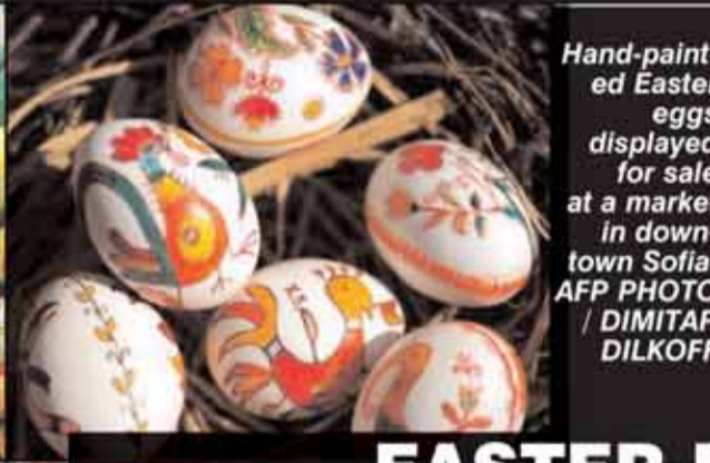
Hand-painted Easter eggs displayed for sale at a market in downtown Sofia.