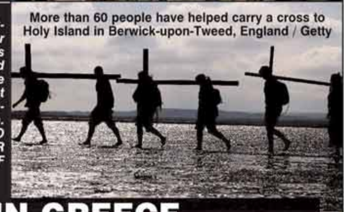
More than 60 people have helped carry a cross to Holy Island in Berwick-upon-Tweed, England