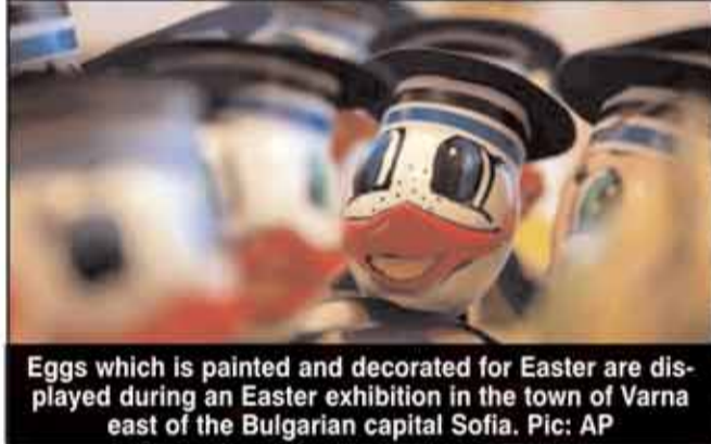
Eggs which is painted and decorated for Easter are displayed during an Easter exhibition in the town of Varna east of the Bulgarian capital Sofia.