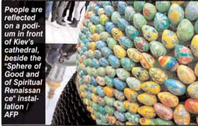
People are reflected on a podium in front of Kiev's cathedral, beside the "Sphere of Good and of Spiritual Renaissance" installation