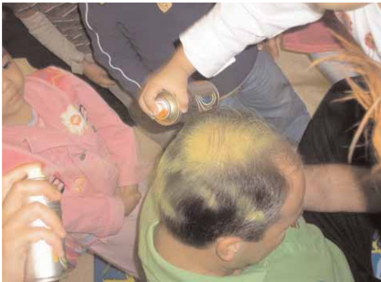
creating a rainbow head

– styling our hair in lots of silly styles to raise money and awareness for leukaemia. The children learned that there are lots of people in the world who are sick and do not have the money to pay for doctors or help make them better. They also learned that children who were sick with leukaemia, often lost their hair, which did not make them feel very happy sometimes. The children recognise that they are helping sick people by wearing crazy hairstyles to