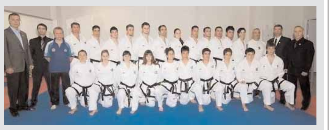
The Competition will be held in the Stadium Islas Malvinas, with capacity for 10.000 spectators. The Greek team is consisted of eight athletes and the coach.

The Greek National team of Taekwon-do travels to Argentina to participate in the X Junior World Championship and the XVI Senior World Championship that will take place in Mar del Plata (Buenos Aires) Argentina, on the 26th to the 29th of November.