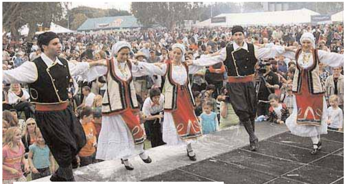
TOP: St Anna's dancers entertain the crowds.