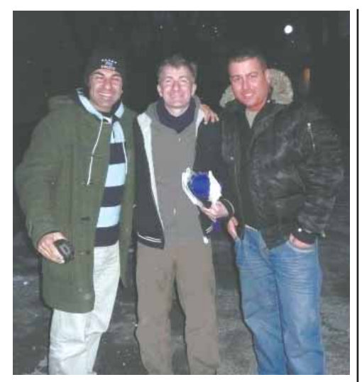
great way to end my trip to the Greek village.