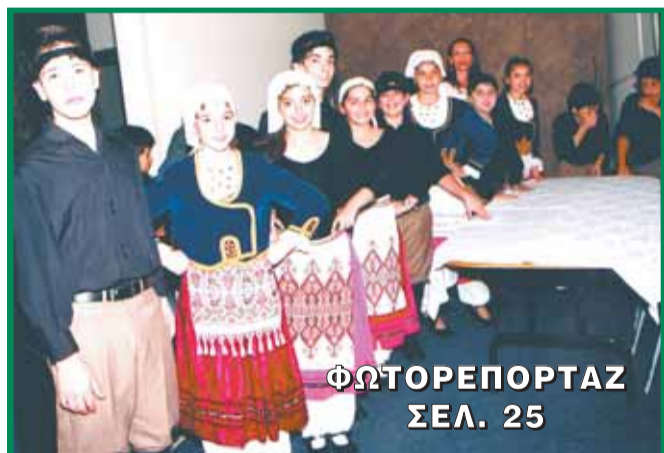
ΦΩΤΟΡΕΠΟΡΤΑΖ ΣΕΛ. 25

Ο ΕΤΗΣΙΟΣ ΧΟΡΟΣ ΤΗΣ ΚΡΗΤΙΚΗΣ ΑΔΕΛΦΟΤΗΤΑΣ