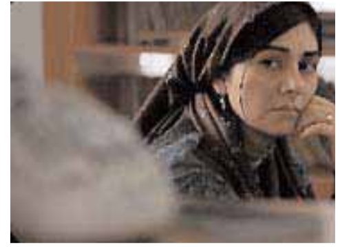
A scene from Abdolreza Kahani's 'Over There' Two feature-length Iranian films are set to be screened at the 49th edition of the International Thessaloniki Film Festival in Greece.