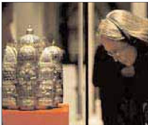
A woman looks at a 12th-century brazier in the form of a domed building, from Constantinople or Italy, on display in the 'Byzantium 330-1453' exhibition at the Royal Academy of Arts in London.

The EU Solidarity Fund, created in 2002, grants aid to member states and acceding countries in the event of a major natural disaster. However, this is the first time the Commission uses the fund for emergency measures in response to a severe drought.